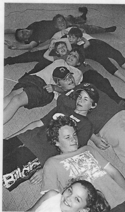
Fun at the camp.